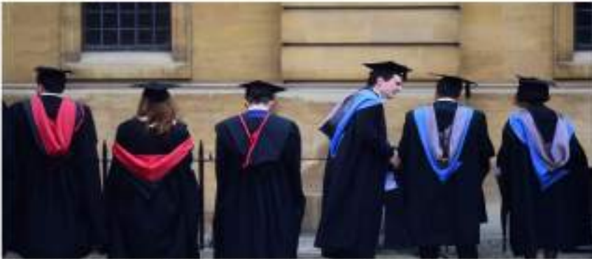
Graduates at Oxford, where a business degree is likely to earn its holder £1 per cent more than the average graduate after five years.

News Universities must end 'incentivised' unconditional offers, education secretary Gavin Williamson says