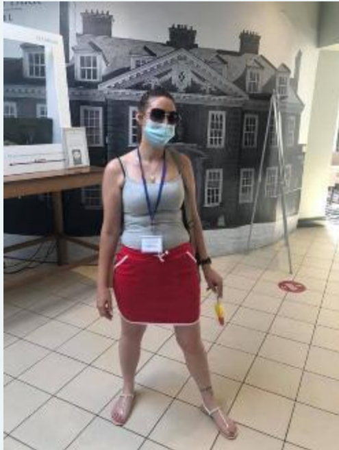
Medic Mentor 2020/21/22