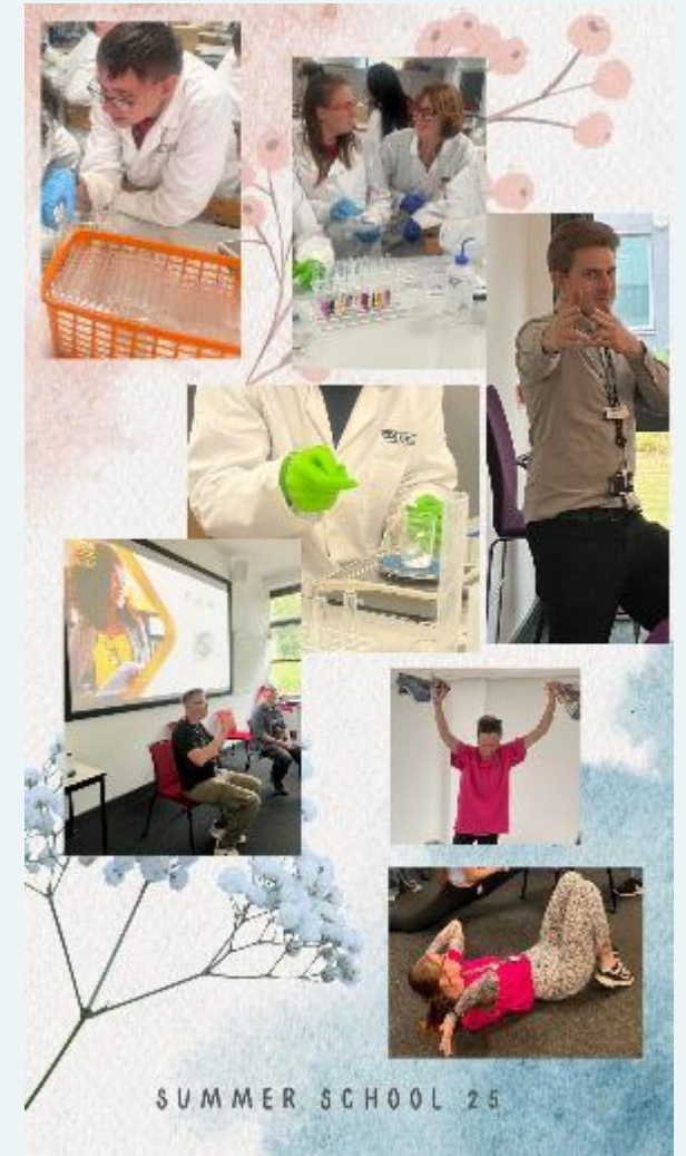
University of Derby 2024/25