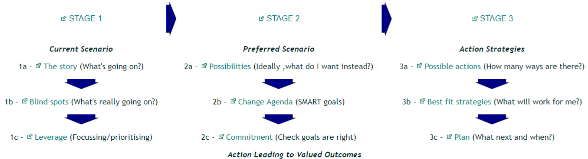
Diagram of the Model

Not everyone needs to address all 3 questions, and at times people may move back into previously answered ones. For simplicity, we'll look at the model sequentially. However, the skilled helper will work with the speaker in all or any of the stages, and move back and forward, as appropriate.